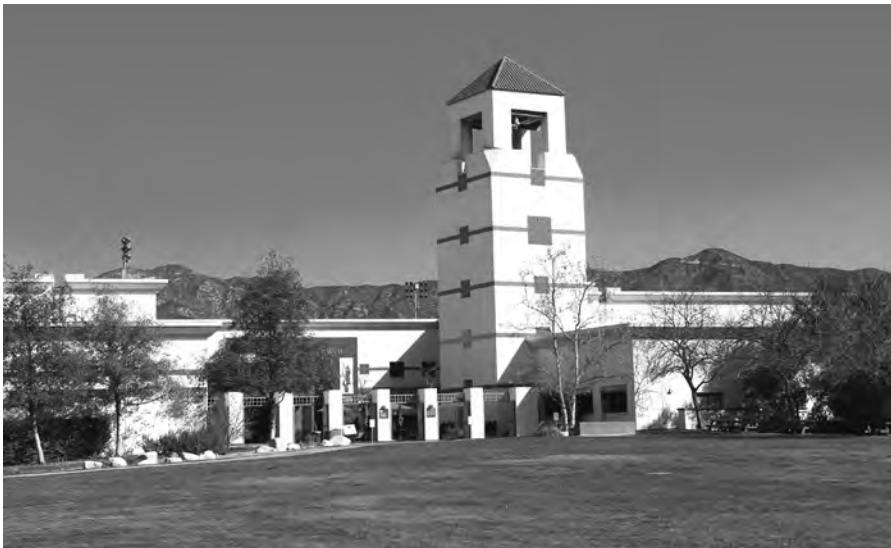
THE AUTRY NATIONAL CENTER OF THE AMERICAN WEST, GRIFFITH PARK CAMPUS

law, legal custom, and agrarian lifeways during the critical transition period between Spanish colonialism and American rule. The Autry Library, located at Griffith Park, and the Braun Research Library, which until very recently was located at the Southwest Museum of the American Indian on the Mount Washington campus but is moving to its new state-of-the-art facility in Burbank, include papers from several prominent Hispanic families that reveal both glimpses and panoramic views of change and continuity in their social circles, material well-being, and rural practices. Moreover, these resources also show how quickly the Americans became part of the California landscape even before the transfer in sovereignty, as some married into Mexican families and experienced firsthand the traditions and practices of Hispanic ranching culture, while others employed to their economic advantage the new political and legal infrastructure established under U.S. sovereignty. Finally, the Autry National Center has a user-friendly online catalogue that allows researchers to search its multiple archival and manuscript collections. The historical vignettes that follow identify and evaluate select items found within certain family papers, emphasizing what the sources tell us about the legal and cultural values that fashioned agrarian life for Hispanic families in California.