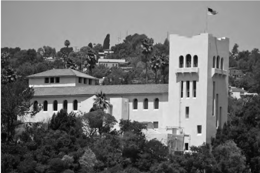
SOUTHWEST MUSEUM OF THE AMERICAN INDIAN, MOUNT WASHINGTON CAMPUS OF THE AUTRY NATIONAL CENTER OF THE AMERICAN WEST