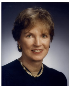
Hon. Kathryn Mickle Werdegar California Supreme Court Justice (Ret.)