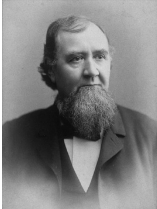
DAVID S. TERRY, CHIEF JUSTICE OF CALIFORNIA (1857–1859)

Terry, who grew to be almost six-and-a-half feet tall, had no formal education after age 13. Instead, he was trained as a lawyer by his uncle, who had a law practice in Houston. Terry was a good apprentice, and he became a member of the Texas bar after two years. In 1846, at age 23, he served as a lieutenant of what later be-