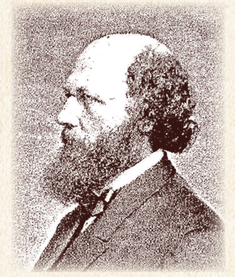
HE ASSAULTED HIM