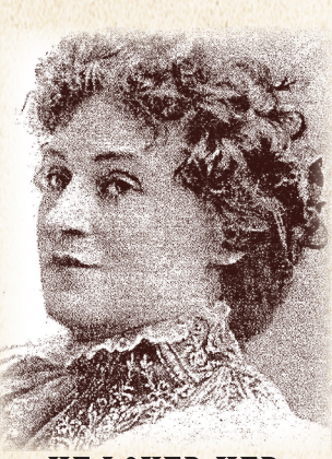
HE LOVED HER