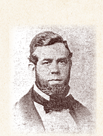
HE SHOT HIM