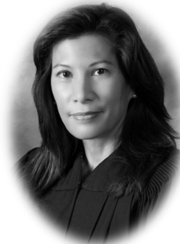
Tani Cantil-Sakauye January 2011-Present