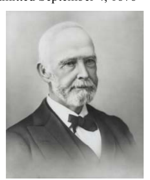
Peter H. Burnett California Supreme Court Justice January 1857 – October 1858